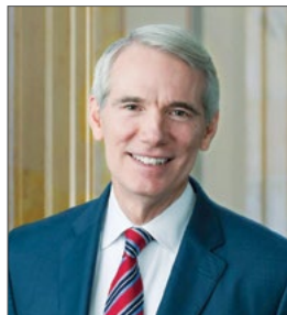
SENATOR ROB PORTMAN (OHIO) United States Senate Sam Miller Goodness Award